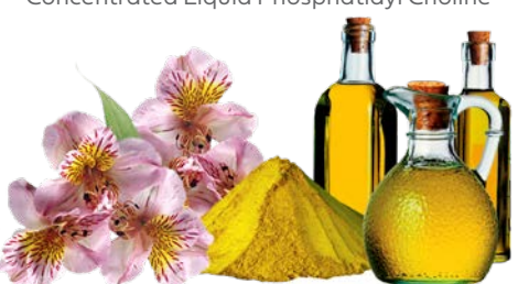
180 Easy-to-Swallow Capsules

Concentrated Liquid Phosphatidyl Choline